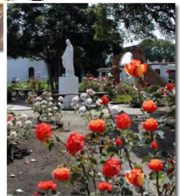
The Rose Garden