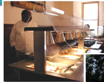
Dining Room Buffet

...and acres of breathtakingly beautiful gardens